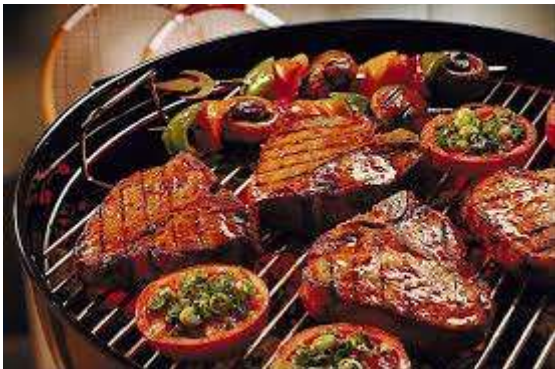
FESTIVAL DE COMIDA INTERNACIONAL