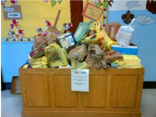
Holy Angels School Thanksgiving Donations November 2016